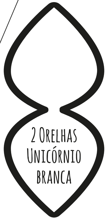
2 ORELHAS UNICÓRNIO BRANCA